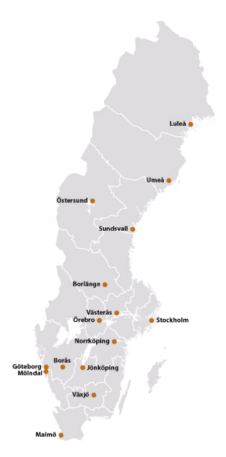
Swedish Agrofood initiatives